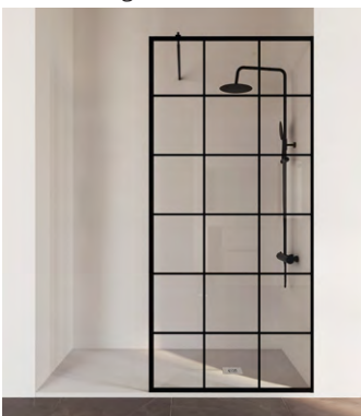
Vidrio Urban Grid