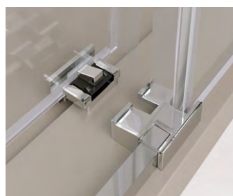
Guía inferior metálica extraíble