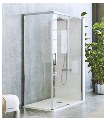
Panel lateral fijo