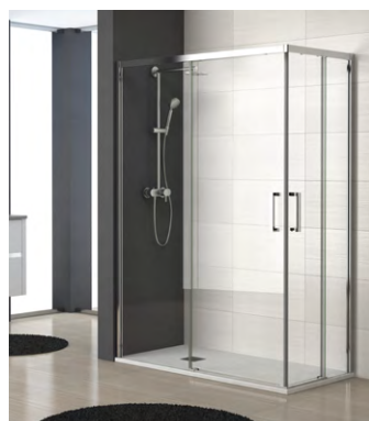
Panel lateral fijo + corredera