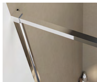
Pletina metálica de 3 mm. opcional