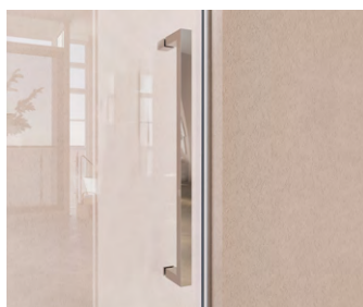
Tirador de acero inoxidable